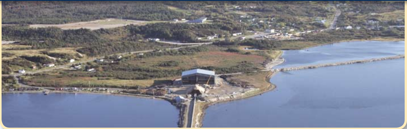
Aur Resources Inc.

The value of mineral shipments is expected to total about $2.6 billion in 2006, almost double the value recorded in 2005, due mainly to increased shipments by Voisey's Bay Nickel Company Ltd.